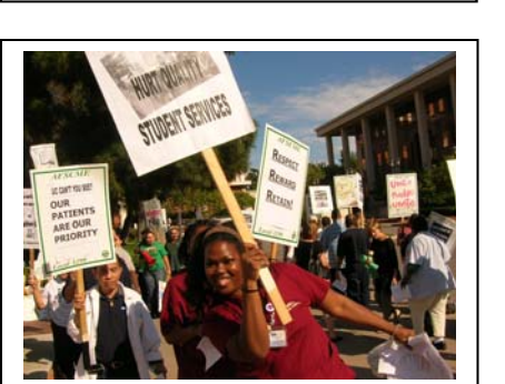
UC Los Angeles