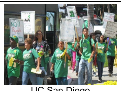
UC San Diego