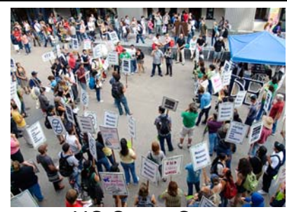
UC Santa Cruz